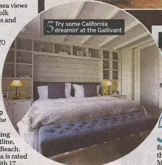
5 Try some California dreamin' at the Gallivant

and it's just a pebble's throw from Brighton Pier. And last month the hotel revealed its revamped Bistro. Trawl Brighton's quirky boutique emporiums and antique stores and don't miss out on the British Airways i360, the 450ft high observation tower on the site of the West Pier ( britishairwaysi360.com ).