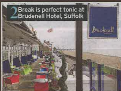
2 Break is perfect tonic at Brudenell Hotel, Suffolk

For sun, sea and shopping, this four-star hotel ticks all the boxes.