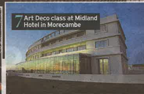
7 Art Deco class at Midland Hotel in Morecambe