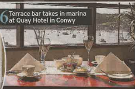
6 Terrace bar takes in marina at Quay Hotel in Conwy