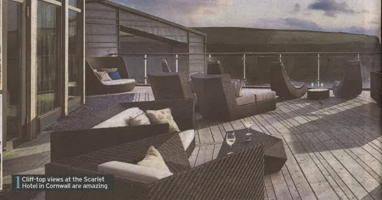
1 Cliff-top views at the Scarlet Hotel in Cornwall are amazing