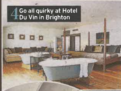
4 Go all quirky at Hotel Du Vin in Brighton