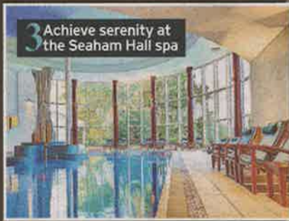
3 Achieve serenity at the Seaham Hall spa