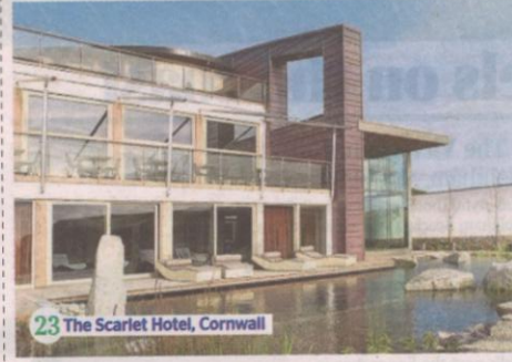
23 The Scarlet Hotel, Cornwall

seafront hotel on the remote Channel Island of Herm. There are no clocks, TVs or phones, and you can play croquet in the garden. Rooms have a nautical feel, and there's a sandy beach and a ferry harbour across the street for sailings to Guernsey. A coastal path circumnavigates the island and you can get around the whole place in an hour or two. Open from May to October. Details B&B doubles are from £170 a night (01481 750075, herm.com/hotel)