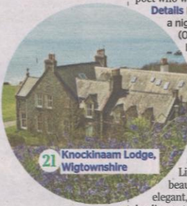
21 Knockinaam Lodge, Wigtownshire

St Brides is right on the Pembrokeshire coastal path and its 34 rooms are divided into three categories: good, better (both with king-sized beds) and best (with super-kings), as well as two-bedroom apartments. All are decorated with a maritime theme. There are restaurants aplenty; two of them are a short stroll away from the harbour front in Saundersfoot. The best thing about this hotel, though, is the hydro infinity pool, heated to body temperature even on frosty days, where hydrotherapy jets will massage you as you gaze out to sea. Details B&B doubles cost from £170 a night (01834 812304, stbridespahotel.com) By Liz Bird, James Ellis, Julia Brookes