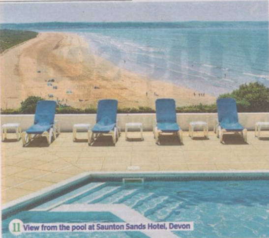
11 View from the pool at Saunton Sands Hotel, Devon

Acres of glass offer stunning floor-to-ceiling sea views from this boutique B&B on the outskirts of bustling fishing village Mevagissey. Five of the six rooms have sea views, some with terraces or Juliet balconies and all with en suites. The owners are happy to make up a picnic before you strike out along the South West Coast Path or visit the Lost Gardens of Heligan or Eden Project. Details B&B doubles cost from £120 a night (01726 844466, pebblehousecornwall.co.uk)