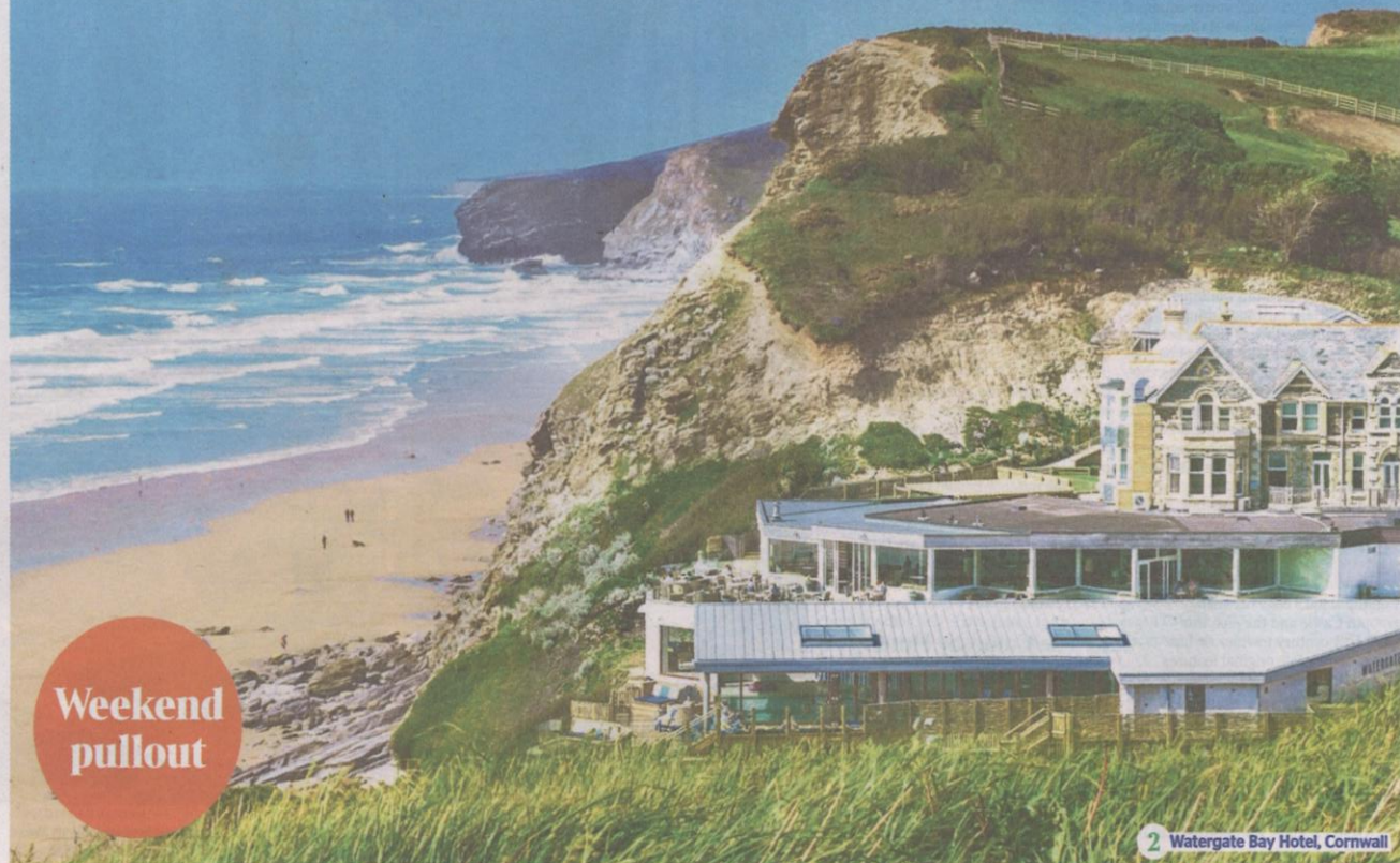
2 Watergate Bay Hotel, Cornwall