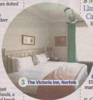
3 The Victoria Inn, Norfolk

This restaurant with rooms is just across the road from Camber Sands, a seven-mile stretch of dunes and beach. The 20 newly refurbished beach-chic rooms boast super king-size beds, oak floors, roll-top baths and sleek walk-in showers. Breakfast is a lavish affair with everything from yoghurt panna cotta to home-cured bacon —