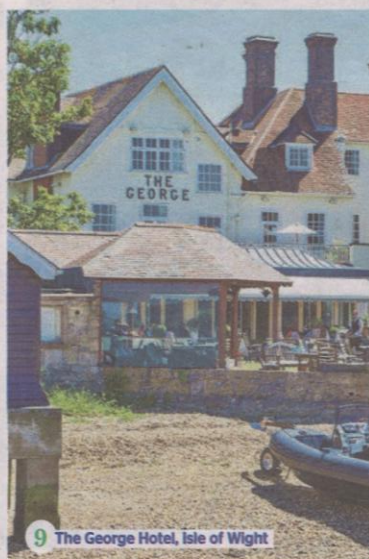
9 The George Hotel, Isle of Wight

plus there's a restaurant with retro-styled furniture. Sporting facilities include a cliff-top tennis court and two pools, and a sandy beach is only steps away. Details B&B doubles are from £120 a night (0844 482152, polurrianhotel.com)