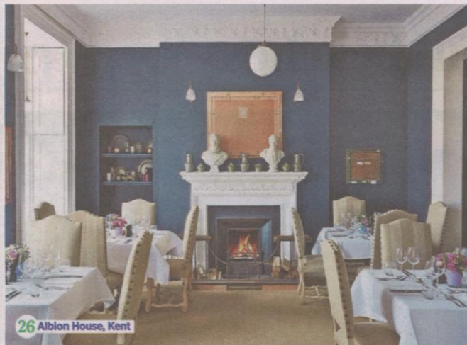
26 Albion House, Kent