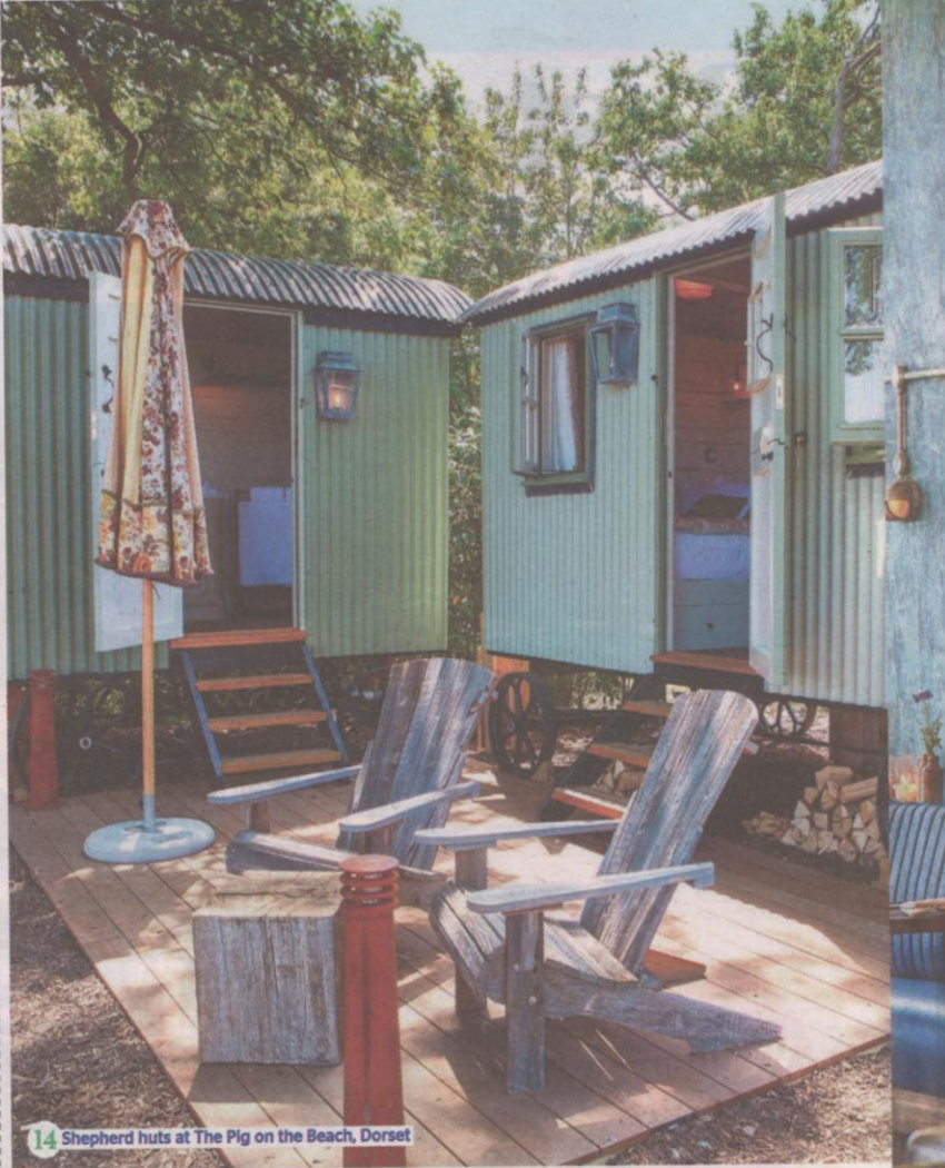
14 Shepherd huts at The Pig on the Beach, Dorset