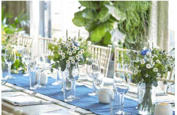
Private dining in the Dining Room