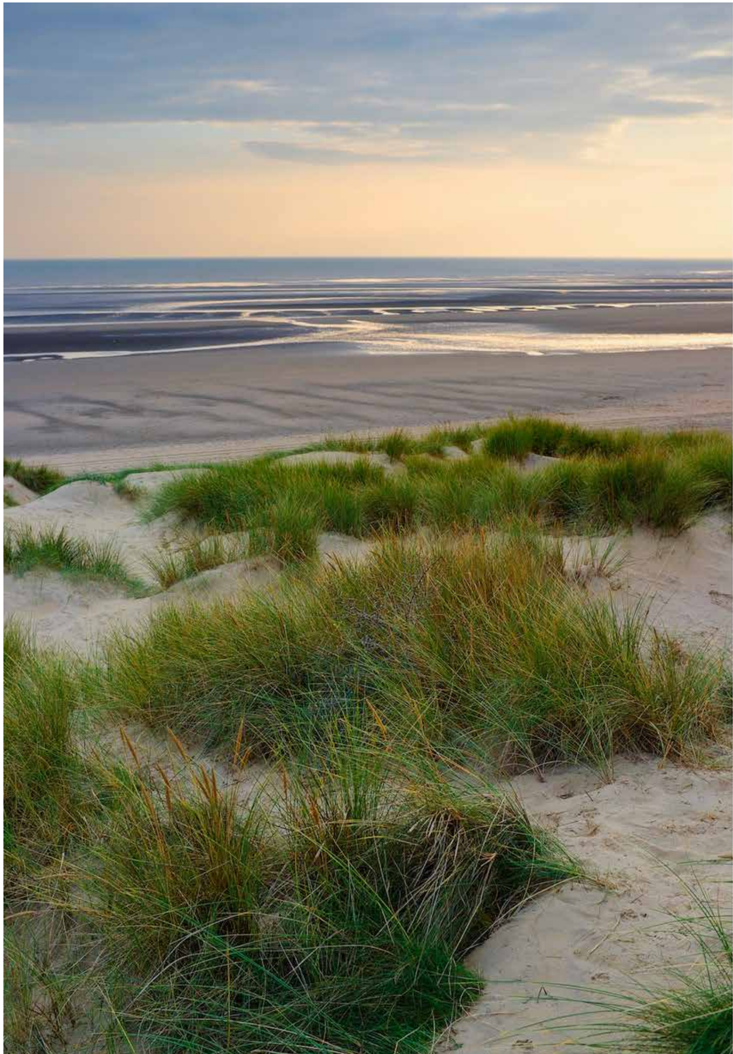
The beach opposite us in Camber