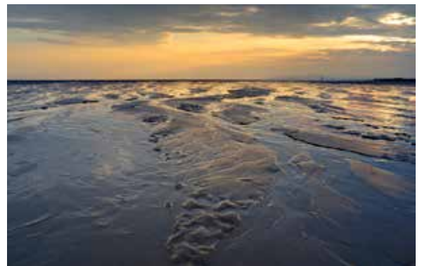
Camber sands at dusk

St Pancras International to Rye (Southeastern)