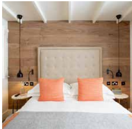
Baby Hampton room