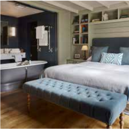
Luxury Garden room