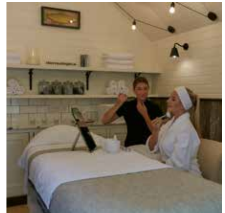
Beach Hut mini spa