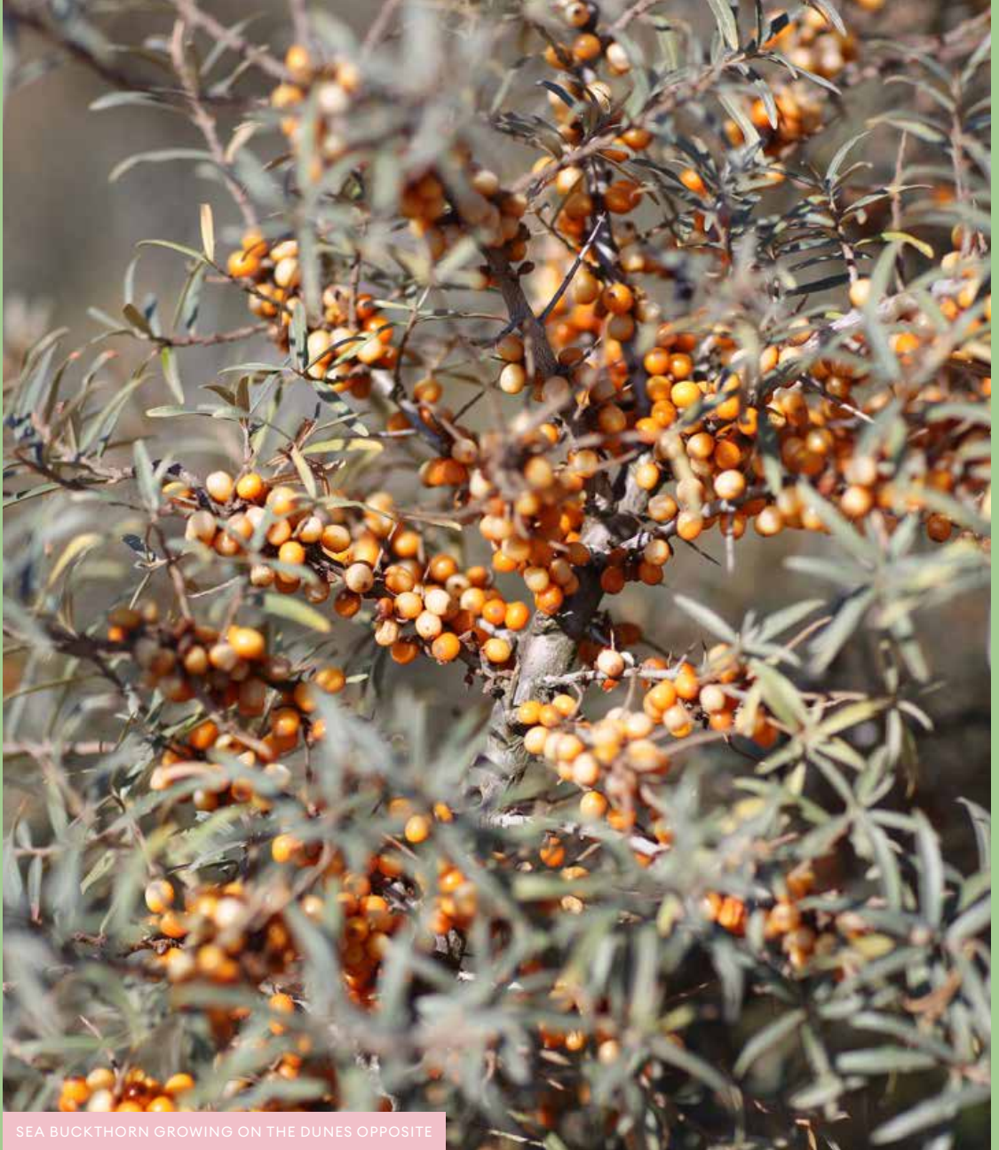
SEA BUCKTHORN GROWING ON THE DUNES OPPOSITE