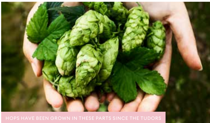
HOPS HAVE BEEN GROWN IN THESE PARTS SINCE THE TUDORS

Lovely farm shop to buy direct - 01580 763 938