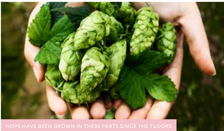
HOPS HAVE BEEN GROWN IN THESE PARTS SINCE THE TUDORS

The family have been growing fruit in Kent for 70 years and started making cider as a hobby. Lovely farm shop to buy direct - 01580 763 938