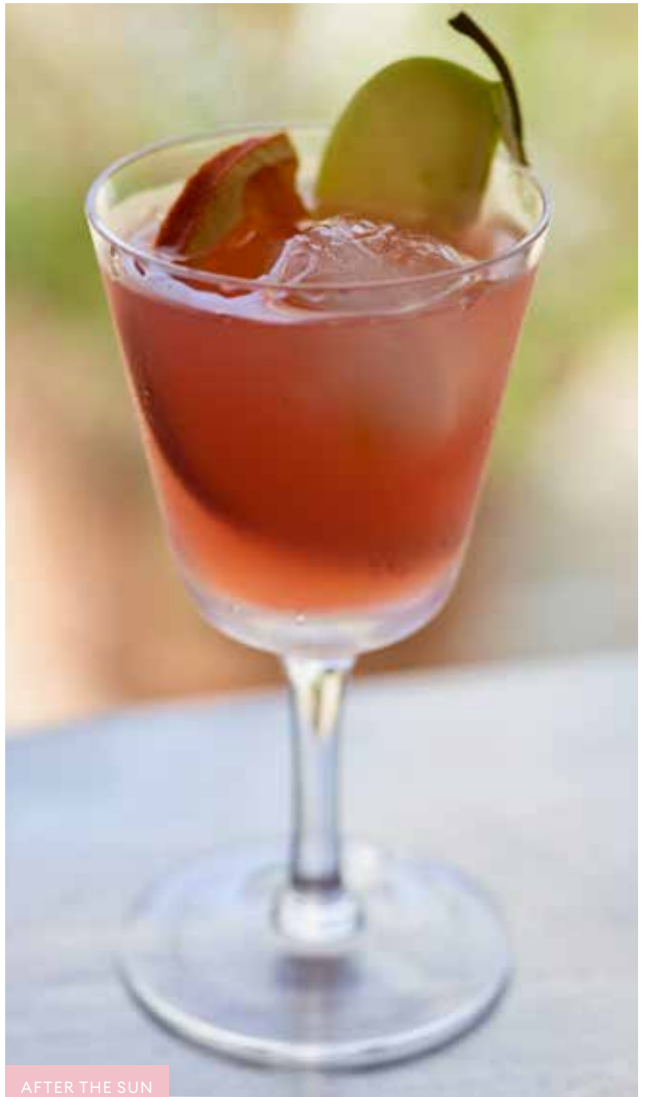
AFTER THE SUN