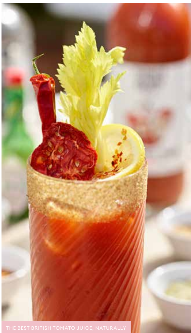
THE BEST BRITISH TOMATO JUICE, NATURALLY