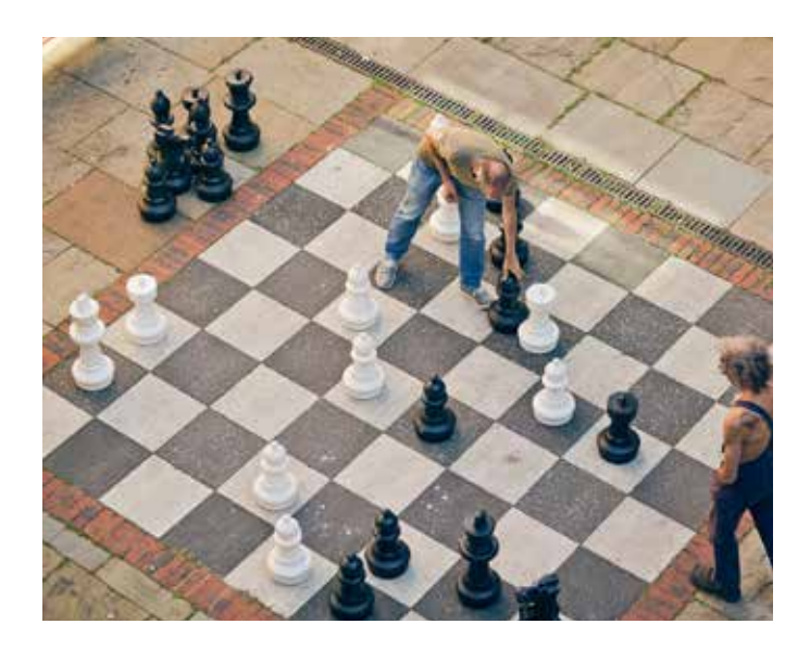
Copyright © 2022 Coastal Hotels Litd